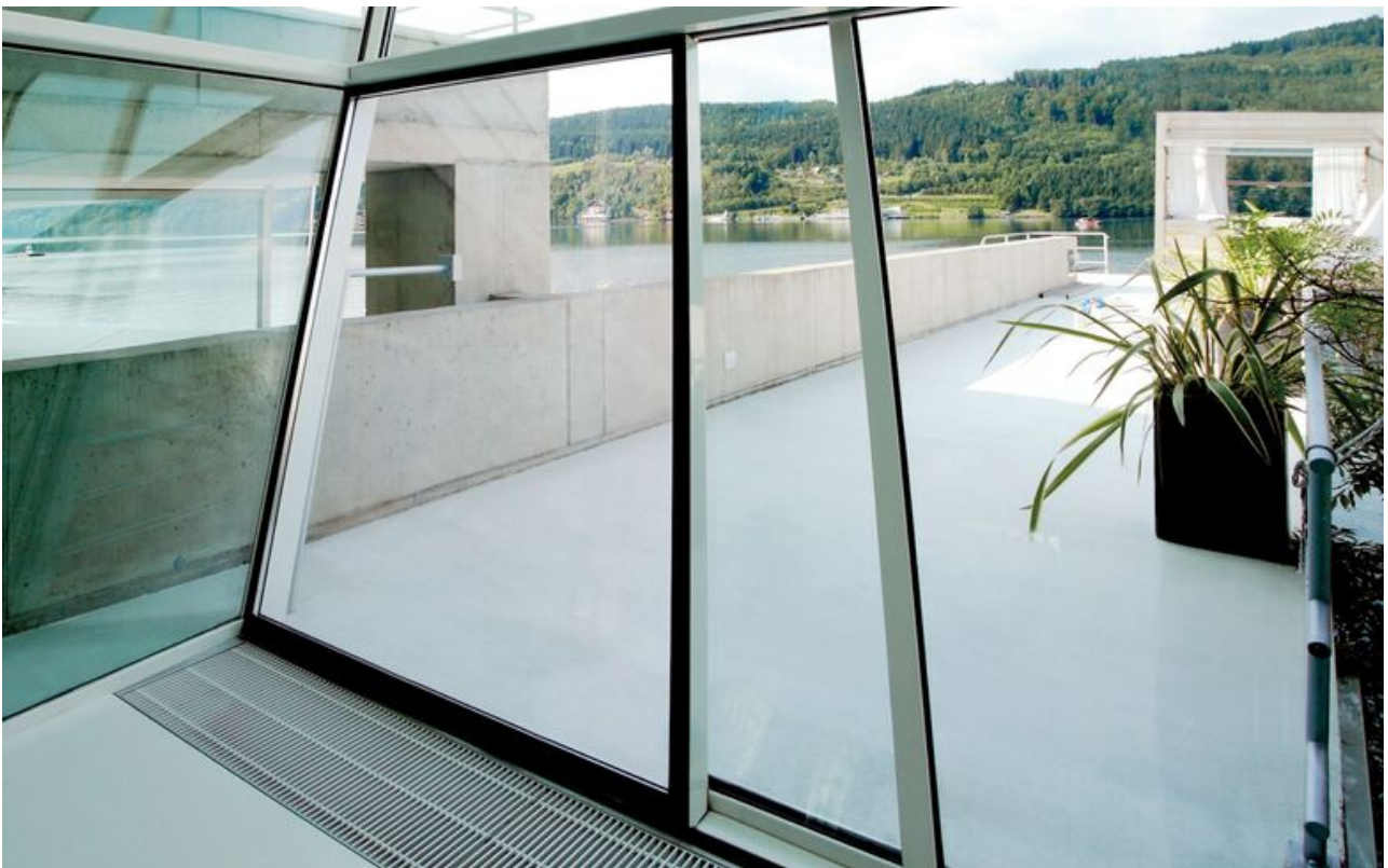
Automatic linear sliding door system for use on inclined glass façades