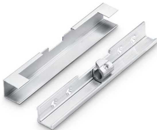
Additional locking mechanism OL 320