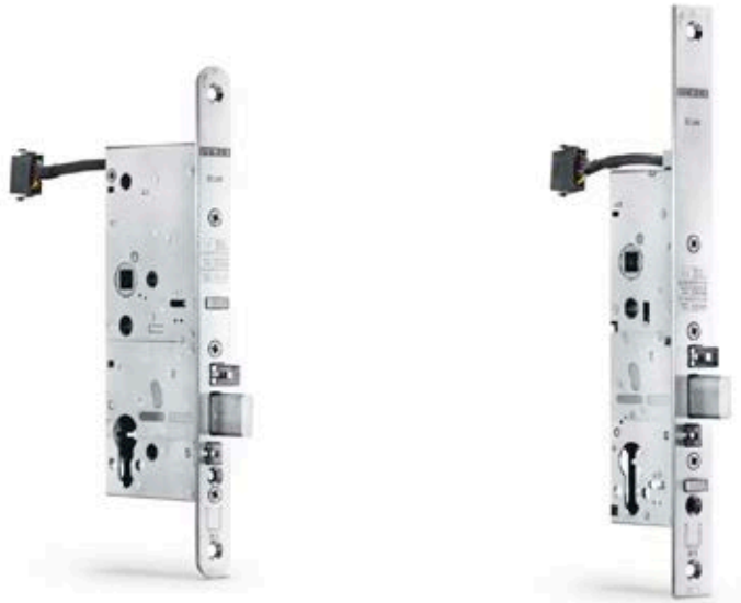
Electromechanical lever lock for combination with access control systems on single leaf doors