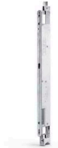
Rod drive IQ AUT