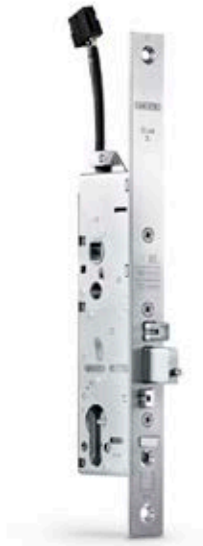
IQ lock EL DL motor lock