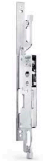
Strike box DL